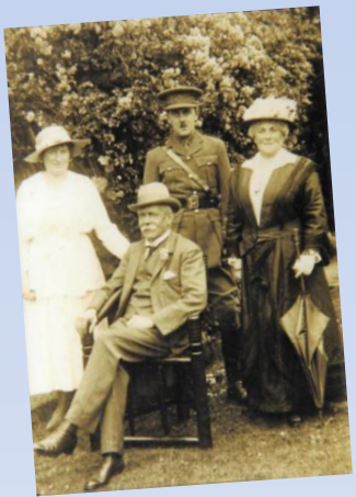
The Dardsley site began as a doctor's house in 1886

A growing range of specialist services – e.g. Physio, ENT, Diabetic Eye Screening